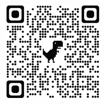
Scan for. SSU Website: How to Join

Security: Members get direct access to personal, independent, confidential expert advice and support